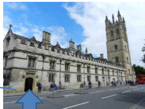
Porters Lodge entrance

Places are limited and allocated on a first come first served basis. To reserve your place please email Jason Todd at: jason.todd@education.ox.ac.uk - with 'OHTN' subject header. Stating name(s) and dietary requirements- lunch is provided.